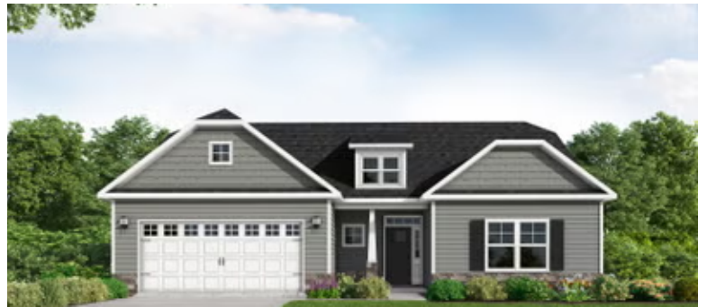
Elevation C with Dutch Hips