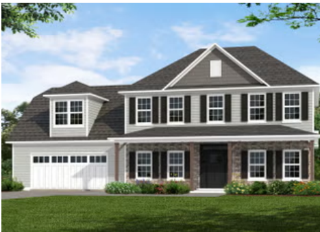
ARCHIVED 07/08/2022 - Elevation B