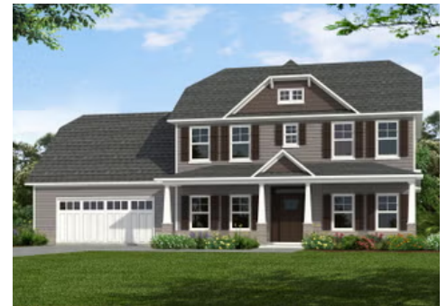
ARCHIVED 07/08/2022 - Elevation D