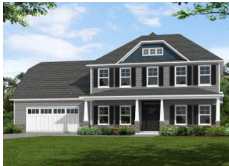
ARCHIVED 07/08/2022 - Elevation C