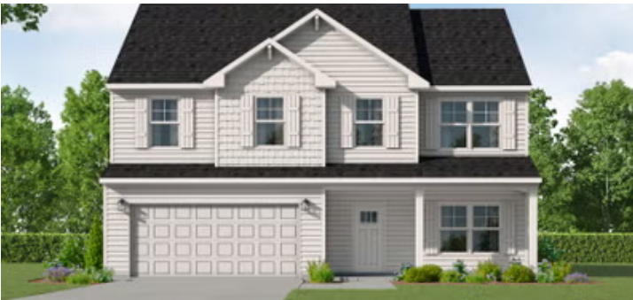
Embark Collection-Elevation A