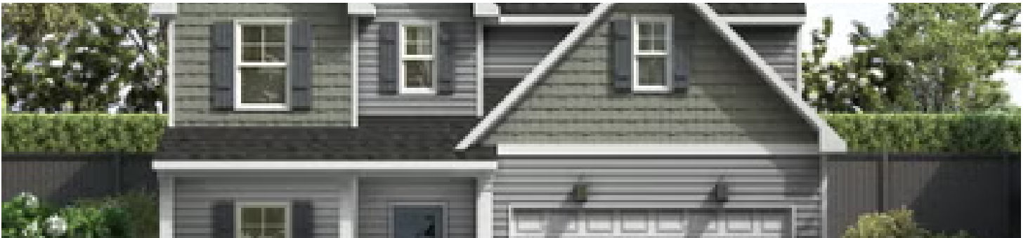
Embark Collection-Elevation A