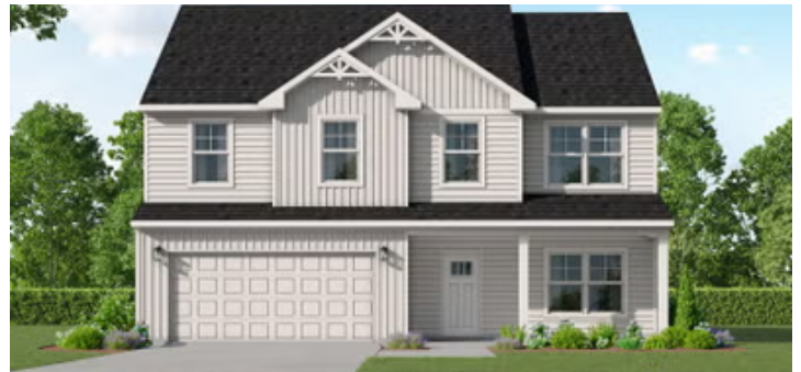
Elevation F-Emabark Collection