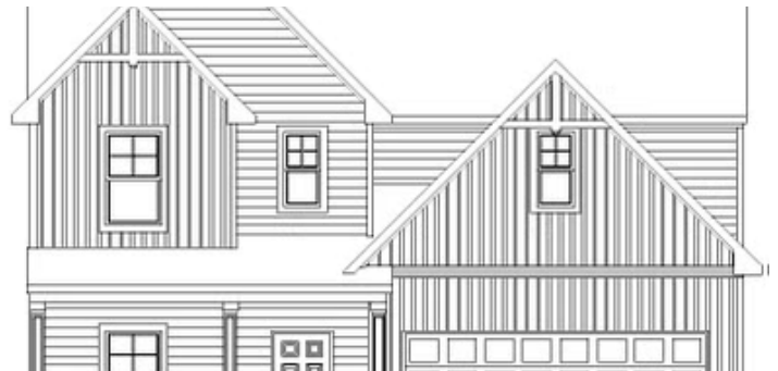
Embark Collection-Elevation F