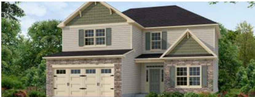
ARCHIVED 1/13/2023 - Elevation B