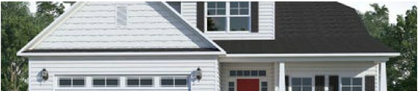
Elevation C with Dutch Hips