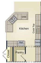
Gourmet kitchen option