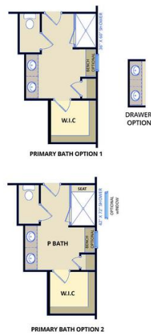
PRIMARY BATH OPTION 1