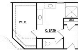
OPT. OWNER'S BATH

Prices, plans, dimensions, features, specifications, materials, and availability of homes or communities are subject to change without notice or obligation. Illustrations are artists depictions only and may differ from completed improvements. All prices subject to change without notice. Please contact your sales associate before writing an offer.