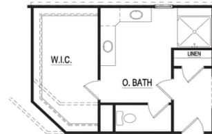
OPT. OWNER'S BATH

Prices, plans, dimensions, features, specifications, materials, and availability of homes or communities are subject to change without notice or obligation. Illustrations are artists depictions only and may differ from completed improvements. All prices subject to change without notice. Please contact your sales associate before writing an offer.