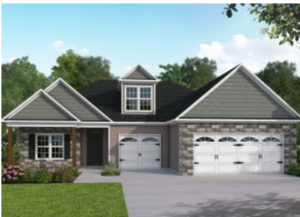
Elevation B - Archived 9/20/2022