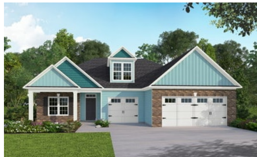
Coastal Elevation - Archived 9/20/2022