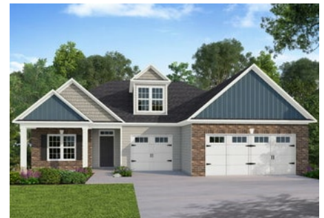
Elevation IB - Archived 9/20/2022