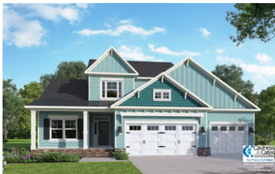
Elevation WB 3 Car Garage