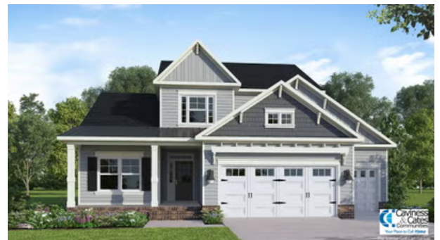
Elevation WB Golf Cart Garage