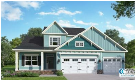
Elevation WB 3 Car Garage