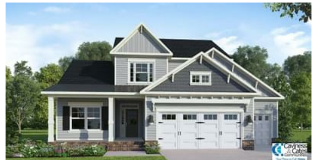
Elevation WB Golf Cart Garage